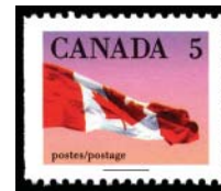
1185 Canada Flag