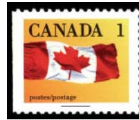
1184 Canada Flag