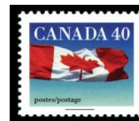
1190 Canada Flag

Designer: Flag: Gottschalk + Ash International.