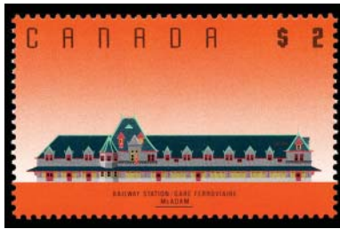
1182 McAdam Railway Station, NB