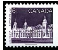
1186 Parliament (East Block)