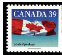
1189 Canada Flag