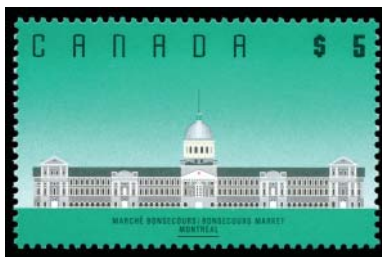
1183 Bonsecours Market, Montreal, QC